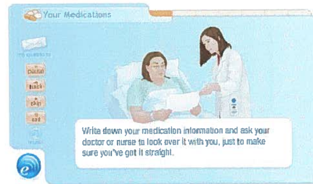
© 2011 Emmi Solutions What to Expect During Your Hospital Stay Emmi program