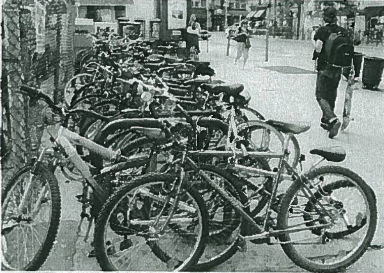
Journal file photo Bikers can

By Khier Casino/The Jersey Journal The Jersey Journal