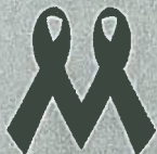
MADELINE FIADINI LORE FOUNDATION for CANCER PREVENTION